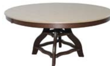
60" Round Dining Table #60-RTD • 29.5" H - (120 lbs.)