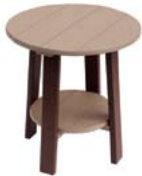
Round Dining End Table #RETD - 42 21" W x 22" H - (17 lbs.)