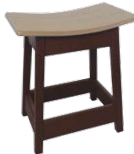
Counter Square Saddle Stool #SXCS-48 20" W x 23" H x 12" D - (19 lbs.)