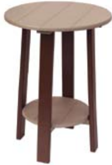
Round Counter End Table #RETC - 43 21" W x 28" H - (18 lbs.)