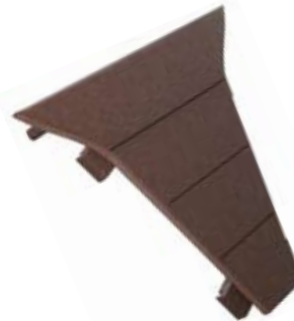
Insert Table for Snuggle-Back Settee # ITS - 35 18" W x 20" D - (6 lbs.)