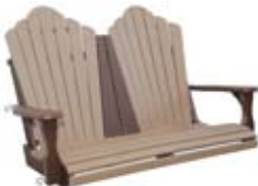
Snuggle-Back Swing 4' * #SS4 - 9 53" W x 28" D x 30" H (64 lbs.)