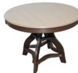
44" Round Dining Table #44-RTD • 29.5" H - (76 lbs.)