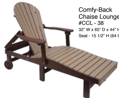
Comfy-Back Chaise Lounge #CCL - 38 32" W x 65" D x 44" H Seat - 15 1/2" H (64 lbs.)

*Our Swings all come with Stainless Steel Chains.