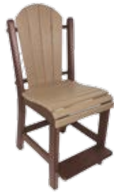
Daisy Comfy Side Counter Chair #DCSC - 14 19" W x 24" D x 43" H Seat - 23 1/2" (29 lbs.)