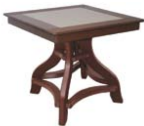
32" Square Dining Table #32-STD • 29.5" H - (63 lbs.)