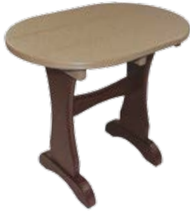
Oval End Table #OET - 2 22" W x 15" D x 20" H - (14 lbs.)