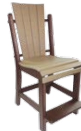
Daisy Square Side Counter Chair #QSC - 14 19" W x 24" D x 43" H Seat - 23 1/2" (29 lbs.)