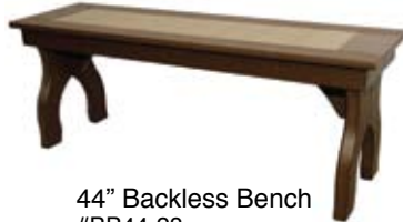
44" Backless Bench #BB44-28 14" D x 44" W • (Approx. 36 - 39 lbs.)