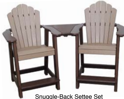
Snuggle-Back Settee Set