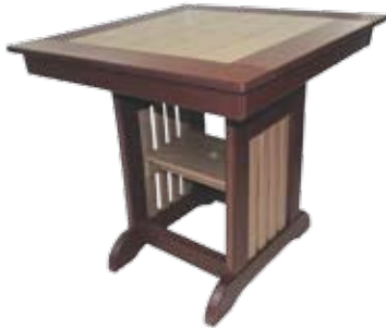
36" Square Brunch / Buffet Table with Removable Shelf

Dining Height #BBSQD-36 • 29.5" H - (80 lbs.)