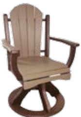
Daisy Comfy Swivel Dining Chair #DCSWD - 22 26" W x 26" D x 37" H Seat - 17 1/2" H (40 lbs.)