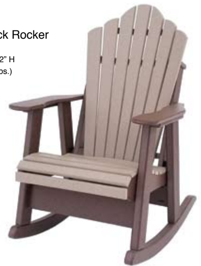
Snuggle-Back Rocker #SBR - 47 29" W x 32" D x 42" H Seat - 17" H (47 lbs.)