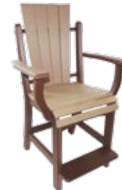
Daisy Square Arm Counter Chair #QAC - 17 26" W x 24" D x 43" H Seat - 23 1/2" (33 lbs.)