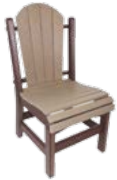
Daisy Comfy Side Dining Chair #DCSD - 13 19" W x 20" D x 37" H Seat - 17 1/2" H (26 lbs.)