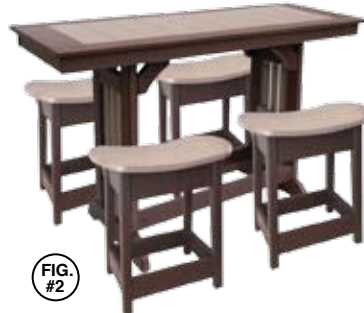
22" x 60" Brunch / Buffet Table* with Saddle Stools

Dining Height #BB22X60-D • 29.5" H - (85 lbs.) Counter Height #BB22X60-C • 36" H - (89 lbs.) Bar Height #BB22X60-B • 42" H - (93 lbs.)