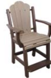
Daisy Arm Counter Chair #DAC - 17 26" W x 24" D x 43" H Seat - 23 1/2" (33 lbs.)