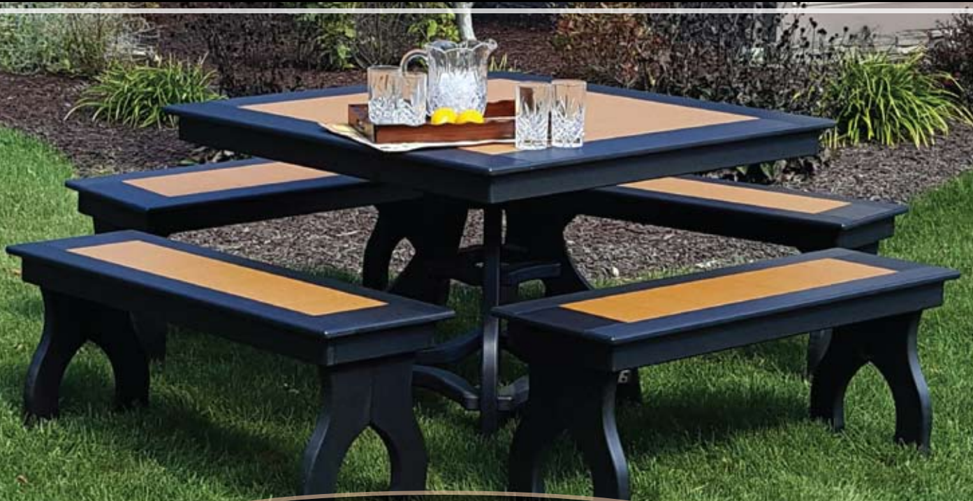
CEDAR ON BLACK 44" BACKLESS BENCHES WITH 44" SQUARE DINING TABLE