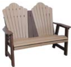
Snuggle-Back Garden Bench #SGB - 8 54" W x 27" D x 40" H Seat - 17" H (68 lbs.)