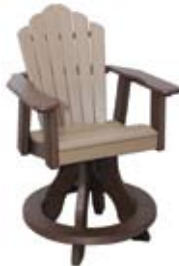
Snuggle-Back Swivel Counter Chair #SBCS - 40 28" W x 30" D x 44" H Seat - 23 3/4" H (59 lbs.)