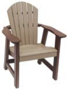
Comfy-Back Dining Chair #CBD - 19 28" W x 28" D x 37" H Seat - 17 1/2" H (37 lbs.)