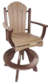
Daisy Comfy Swivel Bar Chair #DCSWB - 24 26" W x 28" D x 49" H Seat - 29 1/2" (61 lbs.)