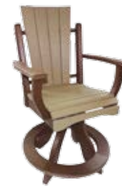
Daisy Square Swivel Counter Chair #QASC - 23 26" W x 30" D x 43" H Seat - 23 3/4" (59 lbs.)