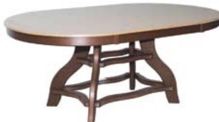
44" x 72" Oval Dining Table #44x72-OTD • 29.5" H - (124 lbs.)