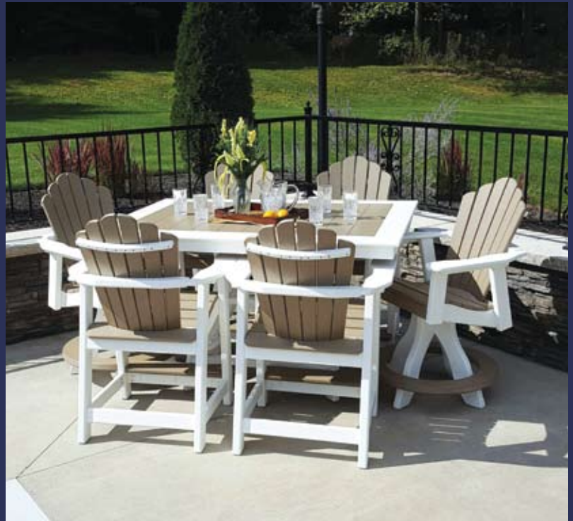
WEATHERED WOOD ON WHITE SNUGGLE-BACK COUNTER CHAIRS, SNUGGLE-BACK SWIVEL COUNTER CHAIRS AND 44" X 60" RECTANGULAR COUNTER TABLE