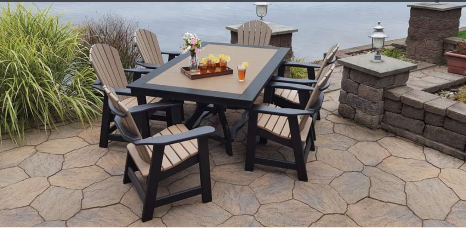
WEATHERED WOOD ON BLACK COMFY-BACK DINING CHAIRS WITH 44" X 72" RECTANGULAR DINING TABLE