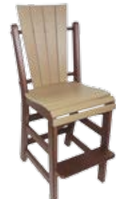
Daisy Square Side Bar Chair #QSB - 15 19" W x 25" D x 49" H Seat - 29 1/2" (35 lbs.)