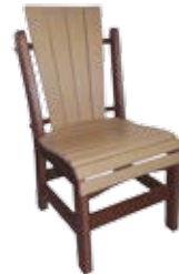
Daisy Square Side Dining Chair #QSD - 13 19" W x 20" D x 37" H Seat - 17 1/2" H (26 lbs.)