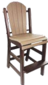
Daisy Comfy Side Bar Chair #DCSB - 15 19" W x 25" D x 49" H Seat - 29 1/2" (35 lbs.)