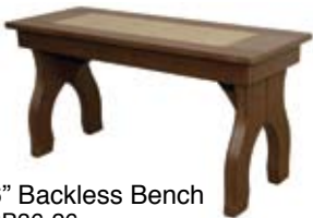
36" Backless Bench #BB36-26 14" D x 36" W • (Approx. 32 - 35 lbs.)