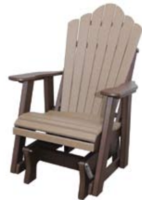
Snuggle-Back Single Glider

* You'll see a very minimal amount of exposed hardware in our designs.