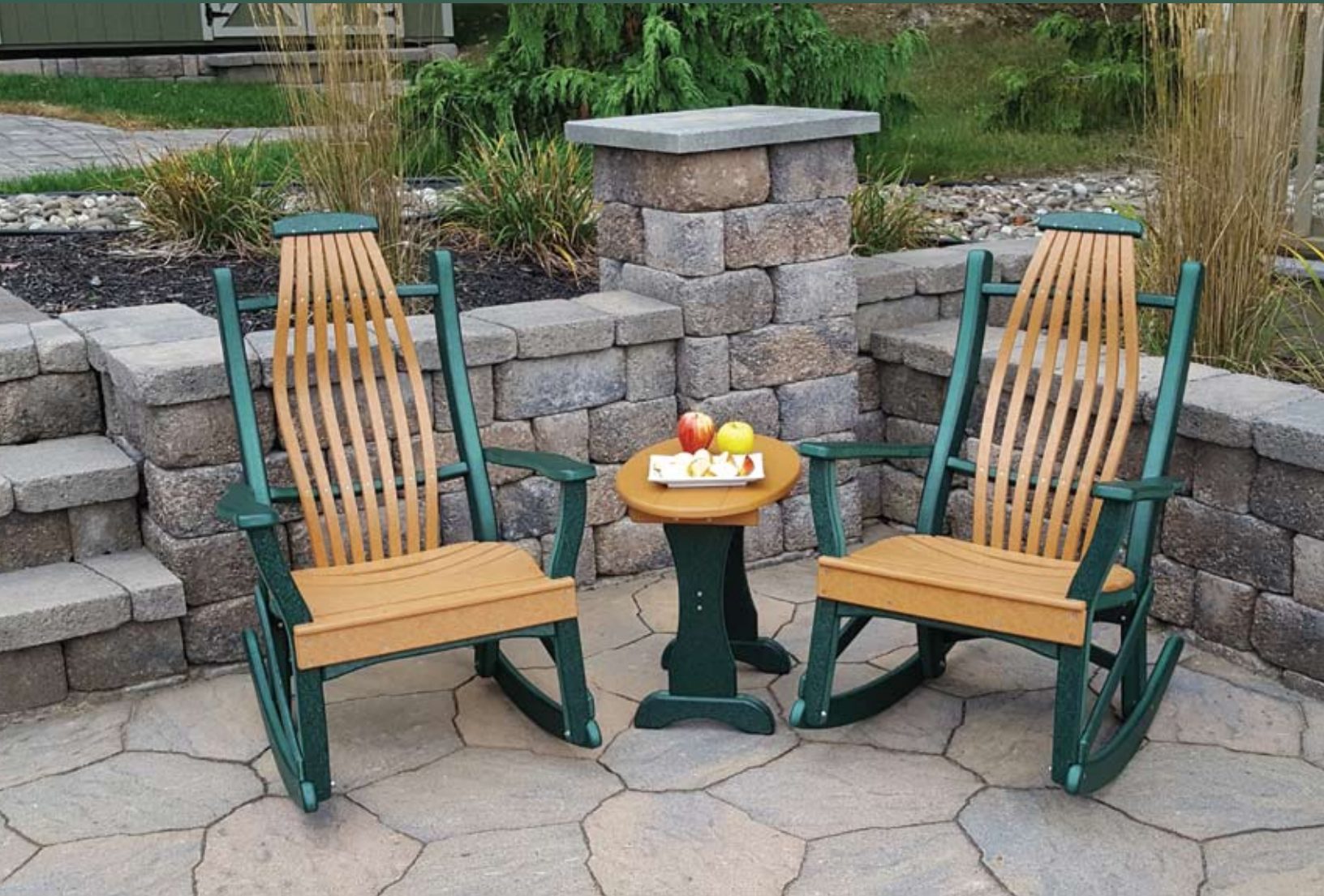
CEDAR ON GREEN WOODLAND ROCKERS WITH OVAL END TABLE

“ UNIQUELY OURS . . . A MASTERPIECE OF COMFORT AND QUALITY ”