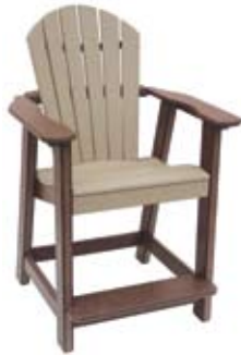
Comfy-Back Counter Chair #CBC - 20 28" W x 30" D x 44" H Seat - 23 3/4" (45 lbs.)