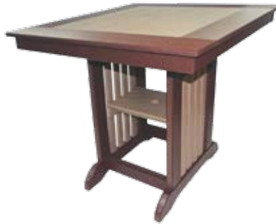
36" Square Brunch / Buffet Table with Removable Shelf

Counter Height #BBSQC-36 • 36" H - (86 lbs.)