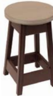
Patio Counter Stool #PSC - 40 15" W x 24" H - (21 lbs.)