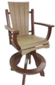
Daisy Square Swivel Bar Chair #QASB - 24 26" W x 28" D x 49" H Seat - 29 1/2" (61 lbs.)