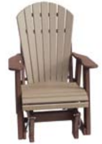
Comfy-Back Single Glider #CSG - 6 29" W x 31" D x 41" H Seat - 17" H (57 lbs.)