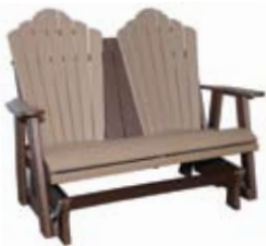
Snuggle-Back Double Glider #SDG - 5 54" W x 31" D x 41" H Seat - 17" H (90 lbs.)

OUR SWIVELS ARE MANUFACTURED IN THE U.S.A.!