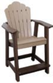
Snuggle-Back Counter Chair #SBC - 20 28" W x 30" D x 44" H Seat - 23 3/4" H (45 lbs.)