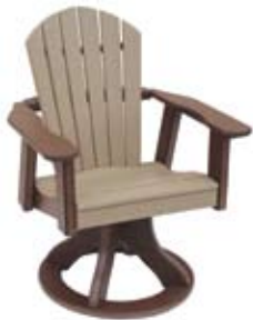
Comfy-Back Swivel Dining Chair #CBSD - 39 28" W x 26" D x 37" H Seat - 17 1/2" H (40 lbs.)