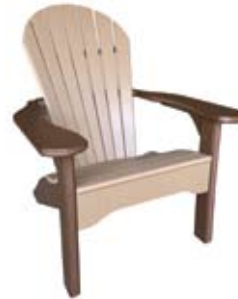
Comfy-Back Adirondack Chair #CA - 7 31" W x 31" D x 40" H Seat - 16" H (40 lbs.)