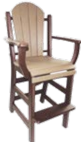
Daisy Comfy Arm Bar Chair #DCAB - 18 26" W x 25" D x 49" H Seat - 29 1/2" (39 lbs.)