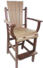
Daisy Square Arm Bar Chair #QAB - 18 26" W x 25" D x 49" H Seat - 29 1/2" (39 lbs.)