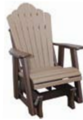
Snuggle-Back Single Glider #SSG - 6 29" W x 31" D x 41" H Seat - 17" H (57 lbs.)