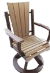
Daisy Square Swivel Dining Chair #QASD - 22 26" W x 26" D x 37" H Seat - 17 1/2" H (40 lbs.)