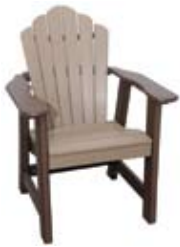
Snuggle-Back Dining Chair #SBD - 19 28" W x 28" D x 37" H Seat - 17 3/4" H (37 lbs.)