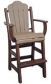
Daisy Arm Bar Chair #DAB - 18 26" W x 25" D x 49" H Seat - 29 1/2" (39 lbs.)