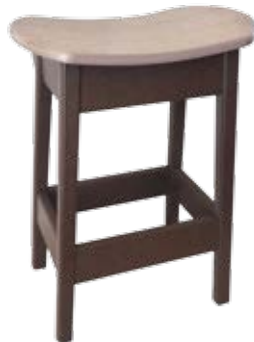
Bar Saddle Stool #SBS - 49 20" W x 29" H x 12" D - (21 lbs.)