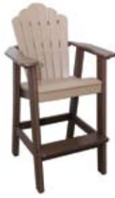
Snuggle-Back Bar Chair #SBB - 21 28" W x 30" D x 50" H Seat - 29 3/4" H (47 lbs.)