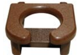
Cup Holder #CH - 37