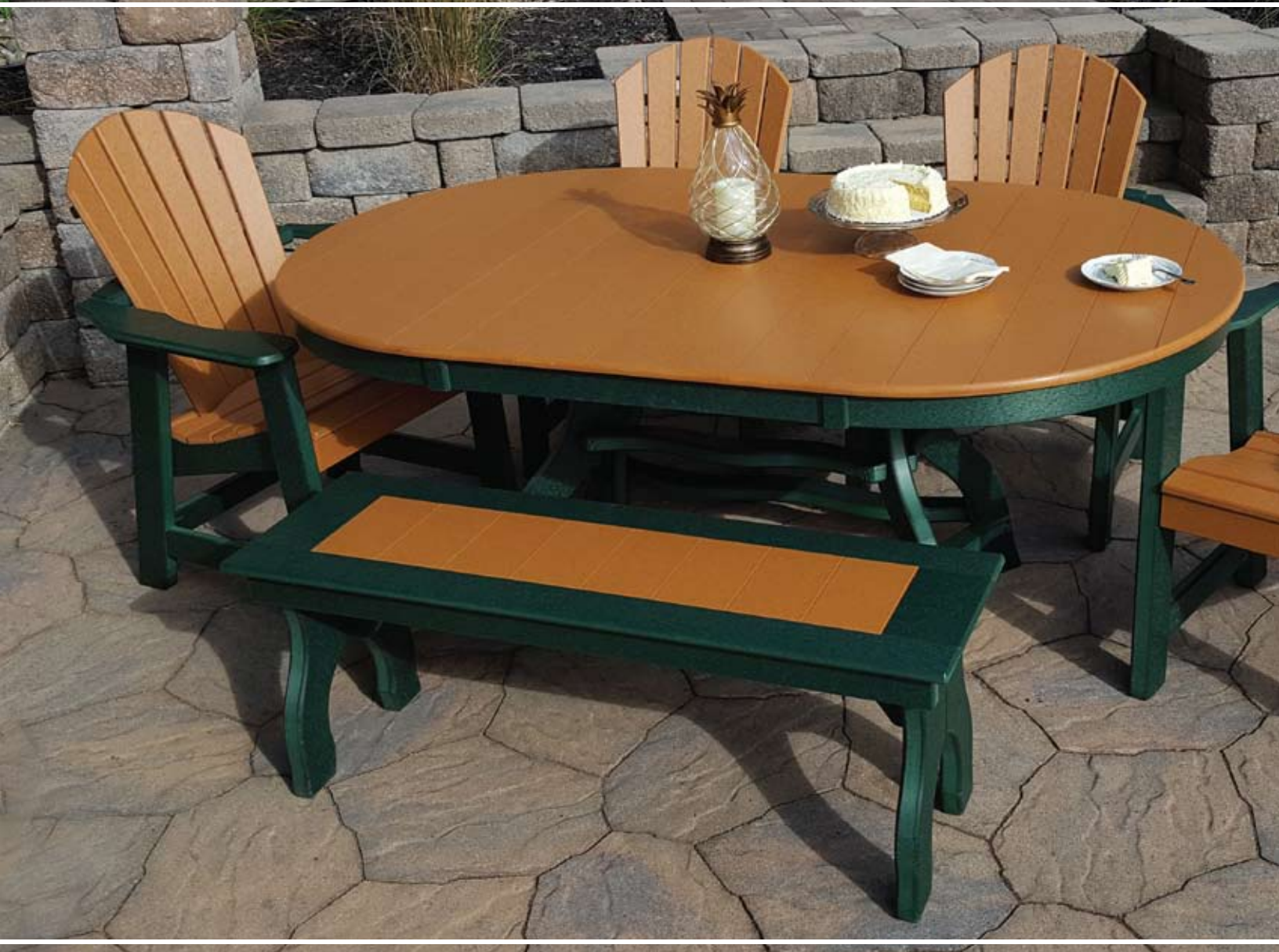
CEDAR ON GREEN COMFY-BACK DINING CHAIRS WITH 48" BACKLESS BENCH AND 44" X 72" OVAL DINING TABLE