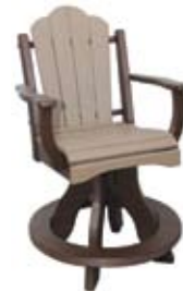
Daisy Arm Swivel Counter Chair #DASC - 23 26" W x 30" D x 43" H Seat - 23 3/4" (59 lbs.)