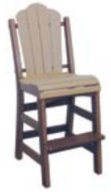
Daisy Side Bar Chair #DSB - 15 19" W x 25" D x 49" H Seat - 29 1/2" (35 lbs.)