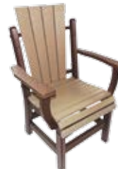
Daisy Square Arm Dining Chair #QAD - 16 26" W x 20" D x 37" H Seat - 17 1/2" H (30 lbs.)