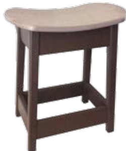
Counter Saddle Stool #SCS-48 20" W x 23" H x 12" D - (19 lbs.)