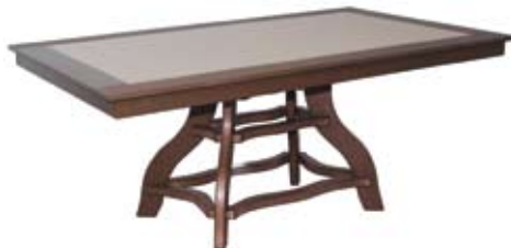
44" x 72" Rectangular Dining Table #44x72-RTD • 29.5" H - (146 lbs.)