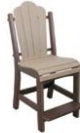
Daisy Side Counter Chair #DSC - 14 19" W x 24" D x 43" H Seat - 23 1/2" (29 lbs.)