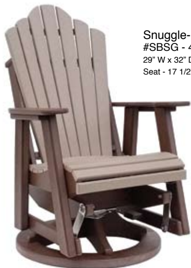
Snuggle-Back Swivel Glider #SBSG - 46 29" W x 32" D x 43" H Seat - 17 1/2" H (76 lbs.)