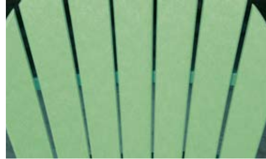
HOSTETLER'S ADIRONDACK CHAIR