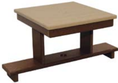
Gliding Settee Table #GST - 33 18" W x 19" D - (18 lbs.)