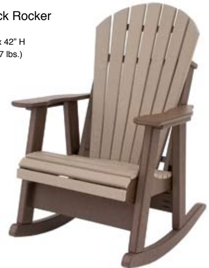
Comfy-Back Rocker #CBR - 47 29" W x 32" D x 42" H Seat - 17" H (47 lbs.)