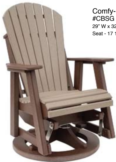
Comfy-Back Swivel Glider #CBSG - 46 29" W x 32" D x 43" H Seat - 17 1/2" H (76 lbs.)