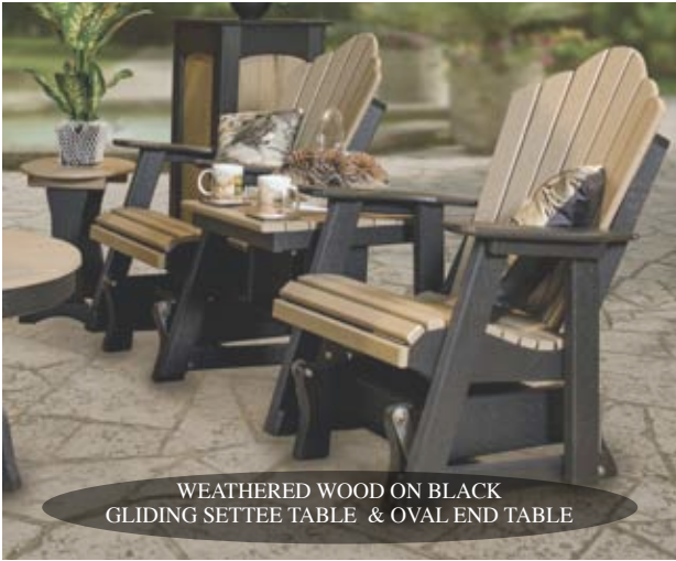
WEATHERED WOOD ON BLACK GLIDING SETTEE TABLE & OVAL END TABLE