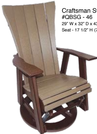
Craftsman Swivel Glider #QBSG - 46

29" W x 32" D x 43" H Seat - 17 1/2" H (76 lbs.)