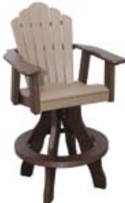
Snuggle-Back Swivel Bar Chair #SBSB - 41 28" W x 30" D x 50" H Seat - 29 3/4" H (61 lbs.)