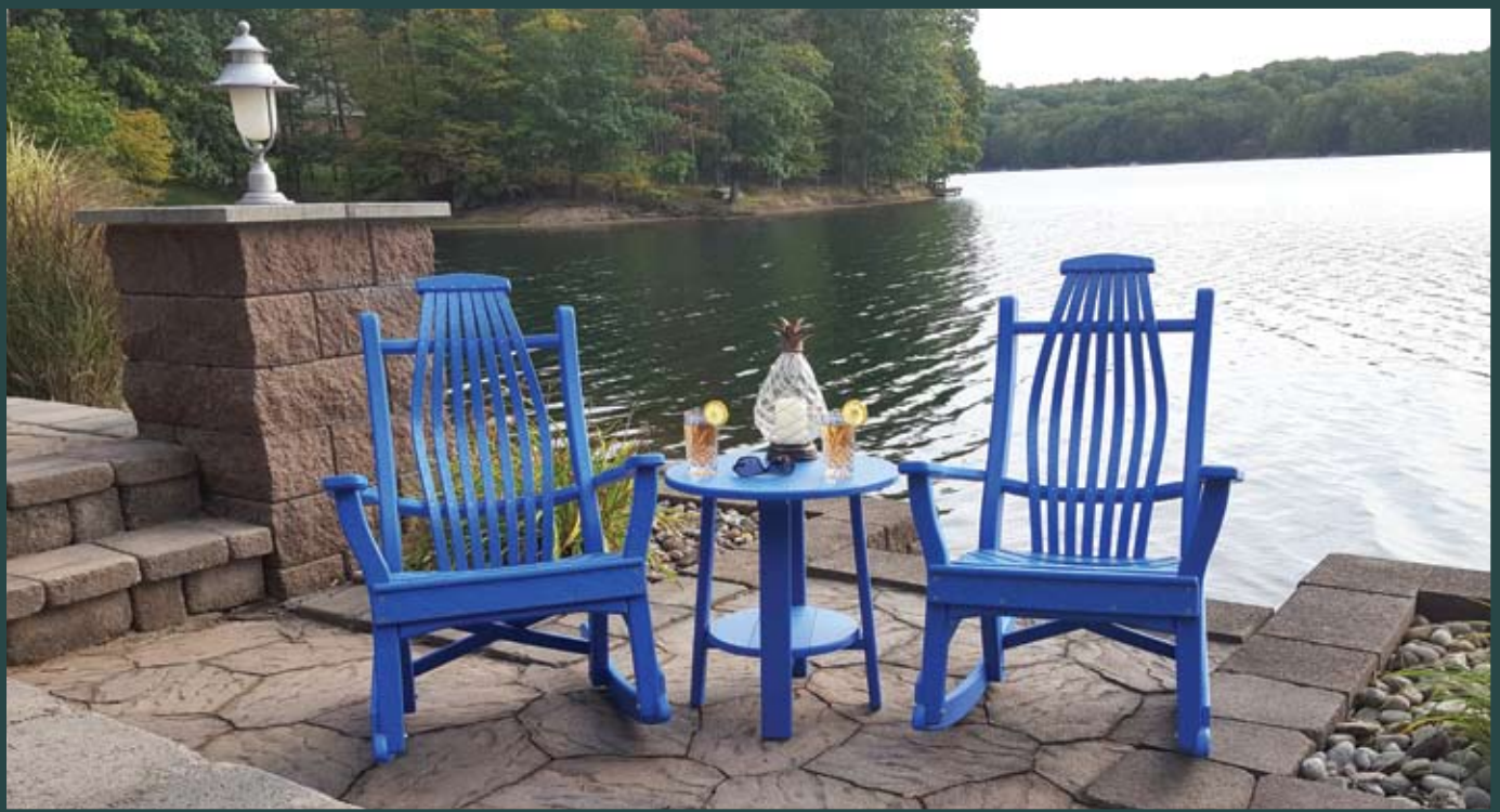
BRIGHT BLUE WOODLAND ROCKERS WITH 21" ROUND DINING END TABLE

PRODUCT INFO & SPECS 26" W x 31" D x 39" H / Seat - 16 1/2" (30 lbs.)