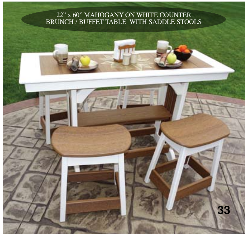
22" x 60" MAHOGANY ON WHITE COUNTER BRUNCH / BUFFET TABLE WITH SADDLE STOOLS

Dining Height #BB22X72-D • 29.5" H - (97 lbs.) Counter Height #BB22X72-C • 36" H - (103 lbs.) Bar Height #BB22X72-B • 42" H - (109 lbs.)