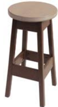
Patio Bar Stool #PSB - 41 15" W x 30" H - (22 lbs.)