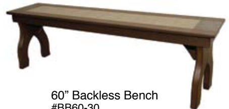
60" Backless Bench #BB60-30 14" D x 60" W • (Approx. 46 - 49 lbs.)