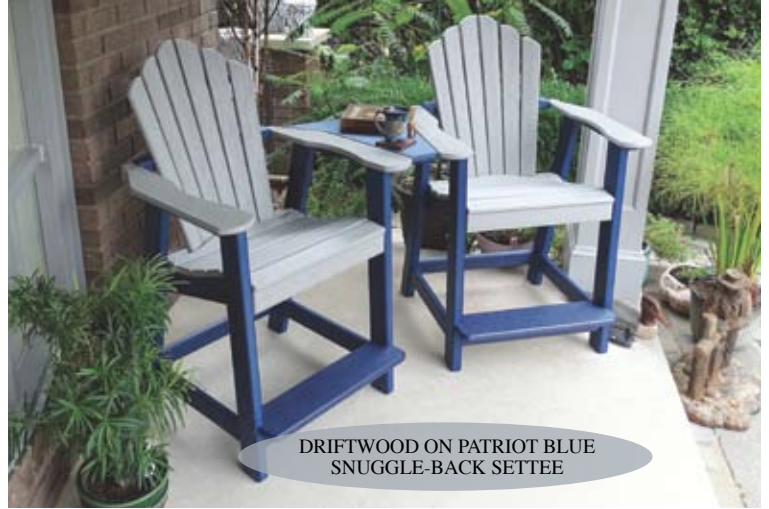
DRIFTWOOD ON PATRIOT BLUE SNUGGLE-BACK SETTEE