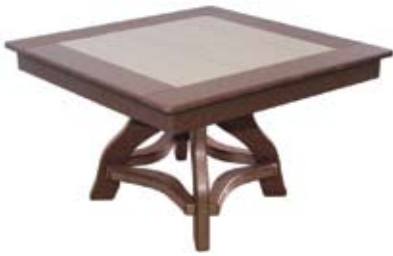
32" Square Chat Table #32-SCT • 18" H - (54 lbs.)