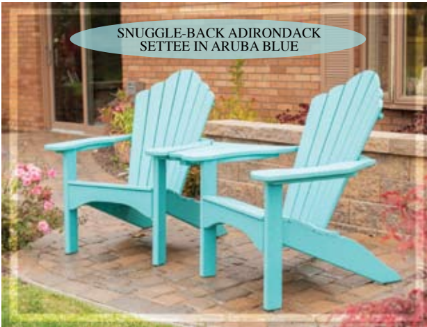
SNUGGLE-BACK ADIRONDACK SETTEE IN ARUBA BLUE