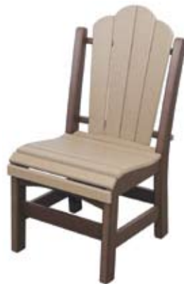
Daisy Side Dining Chair