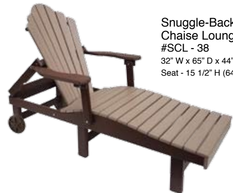
Snuggle-Back Chaise Lounge #SCL - 38 32" W x 65" D x 44" H Seat - 15 1/2" H (64 lbs.)

*Our Swings all come with Stainless Steel Chains.