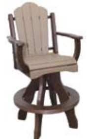
Daisy Arm Swivel Bar Chair #DASB - 24 26" W x 28" D x 49" H Seat - 29 1/2" (61 lbs.)

OUR SWIVELS ARE MANUFACTURED IN THE U.S.A.!