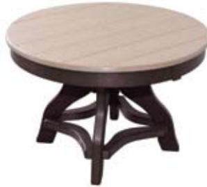
32" Round Chat Table #32-RCT • 18" H - (46 lbs.)