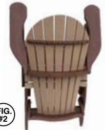
Comfy-Back Folding Adirondack Chair #CFA - 45 31" W x 31" D x 41" H Seat - 16" H (41 lbs.)