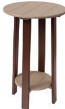
Round Bar End Table #RETB - 44 21" W x 34" H - (19 lbs.)