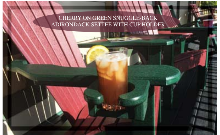
CHERRY ON GREEN SNUGGLE-BACK ADIRONDACK SETTEE WITH CUP HOLDER

EVEN MORE REASONS FOR YOU TO LOVE “THE HOSTETLER DIFFERENCE”