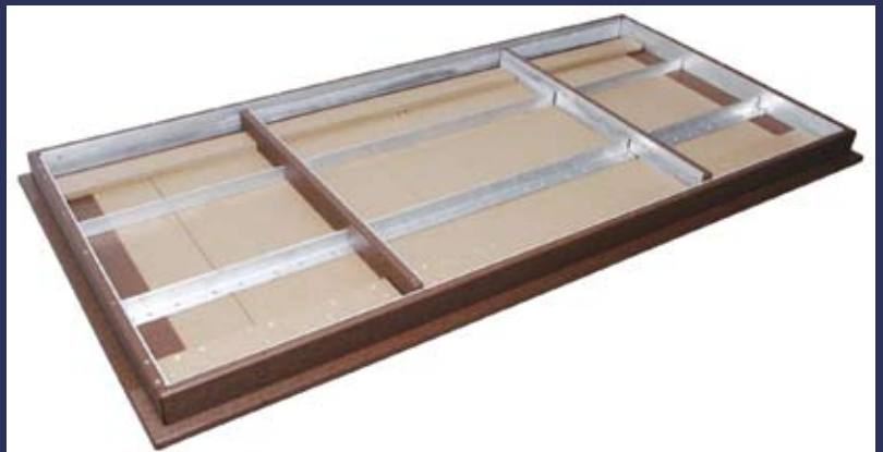
ALL OF OUR TABLES ARE SUPPORTED WITH STRONG ALUMINUM FRAMES!