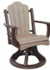
Daisy Arm Swivel Dining Chair #DASD - 22 26" W x 26" D x 37" H Seat - 17 1/2" H (40 lbs.)