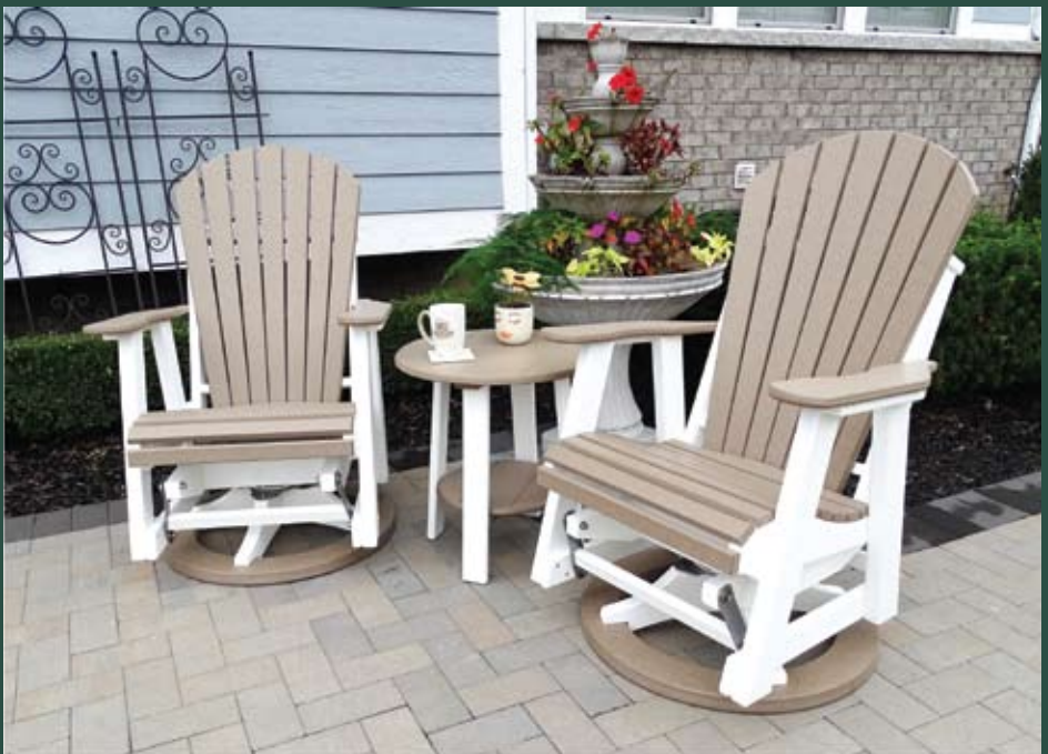
WEATHERED WOOD ON WHITE COMFY-BACK SWIVEL GLIDERS WITH ROUND DINING END TABLE