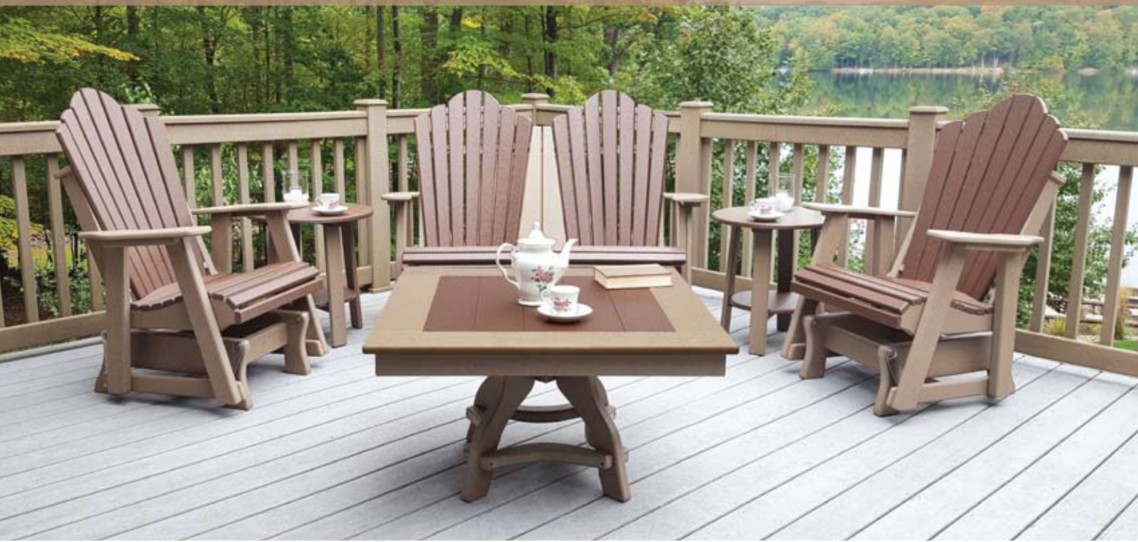
BROWN ON WEATHERED WOOD SNUGGLE-BACK SINGLE GLIDERS, DOUBLE GLIDER, ROUND DINING END TABLES, AND 36" SQUARE CHAT TABLE