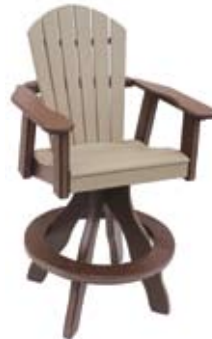
Comfy-Back Swivel Bar Chair #CBSB - 41 28" W x 30" D x 50" H Seat - 29 3/4" (61 lbs.)