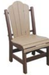
Daisy Side Dining Chair #DSD - 13 19" W x 20" D x 37" H Seat - 17 1/2" H (26 lbs.)