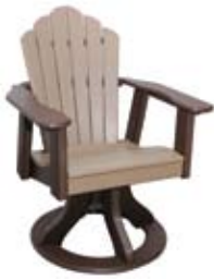
Snuggle-Back Swivel Dining Chair #SBSD - 39 28" W x 26" D x 37" H Seat - 17 1/2" H (40 lbs.)