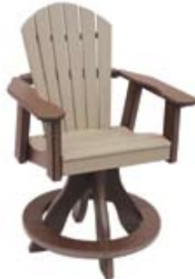
Comfy-Back Swivel Counter Chair #CBSC - 40 28" W x 30" D x 44" H Seat - 23 3/4" (59 lbs.)