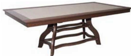
44" x 84" Rectangular Dining Table #44x84-RTD • 29.5" H - (165 lbs.)