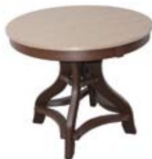
36" Round Dining Table #36-RTD • 29.5" H - (57 lbs.)