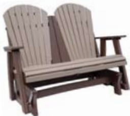
Comfy-Back Double Glider #CDG - 5 54" W x 31" D x 41" H Seat - 17" H (90 lbs.)

OUR SWIVELS ARE MANUFACTURED IN THE U.S.A.!