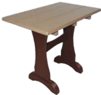
Square End Table #QET - 2 22" W x 15" D x 20" H - (14 lbs.)