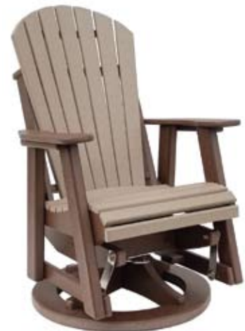
Comfy-Back Swivel Glider

* At HTC, we custom shape the edges on each piece of poly lumber. We custom shape every single slat, from the seat to the back assembly all the way down to the leg assembly. In contrast, our competitors typically construct their furniture using the Raw Poly Lumber as it comes with it's original factory edges.