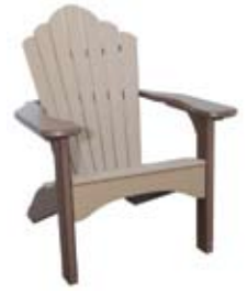
Snuggle-Back Adirondack Chair #SA - 7 31" W x 31" D x 40" H Seat - 16" H (40 lbs.)