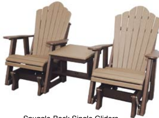
Snuggle-Back Single Gliders with Gliding Settee Table