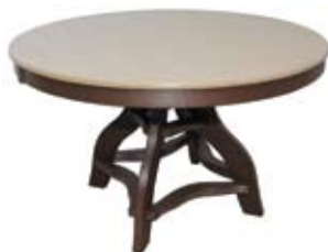
48" Round Dining Table #48-RTD • 29.5" H - (86 lbs.)