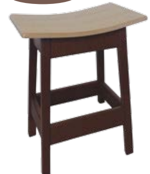
Bar Square Saddle Stool #SXBS - 49 20" W x 29" H x 12" D - (21 lbs.)