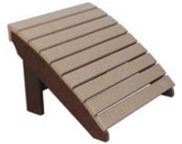
Adirondack Footstool #AF - 34 21" W x 22" D x 16" H - (18 lbs.)