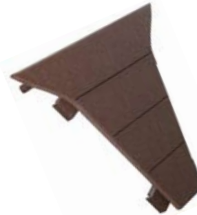
Insert Table for Adirondack Chair # ITA - 36 18" W x 20" D - (6 lbs.)