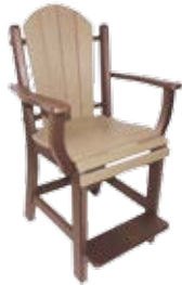
Daisy Comfy Arm Counter Chair #DCAC - 17 26" W x 24" D x 43" H Seat - 23 1/2" (33 lbs.)