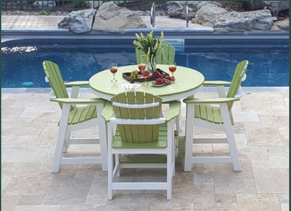
LIME ON WHITE COMFY-BACK COUNTER CHAIRS WITH 48" ROUND COUNTER TABLE