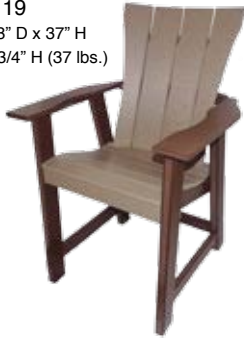
Craftsman Counter Chair #QBC - 20

28" W x 28" D x 37" H Seat - 17 3/4" H (37 lbs.)