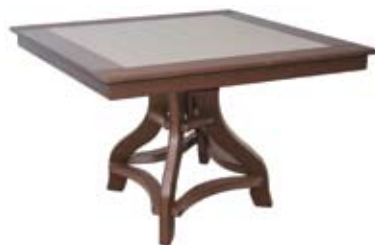
44" Square Dining Table #44-STD • 29.5" H - (95 lbs.)