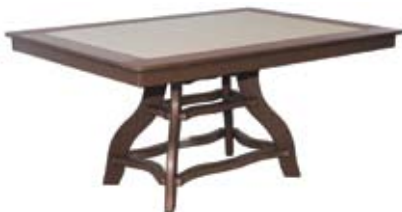
44" x 60" Rectangular Dining Table #44x60-RTD • 29.5" H - (124 lbs.)