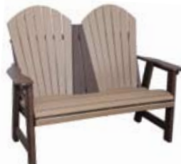
Comfy-Back Garden Bench #CGB - 8 54" W x 27" D x 40" H Seat - 17" H (68 lbs.)