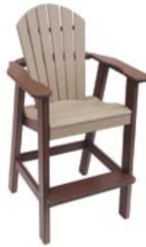
Comfy-Back Bar Chair #CBB - 21 28" W x 30" D x 50" H Seat - 29 3/4" (47 lbs.)