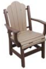
Daisy Arm Dining Chair #DAD - 16 26" W x 20" D x 37" H Seat - 17 1/2" H (30 lbs.)