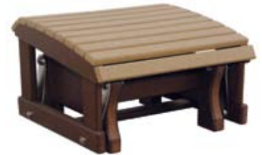
Gliding Ottoman #GO - 32 19" W x 19" D x 14" H - (23 lbs.)