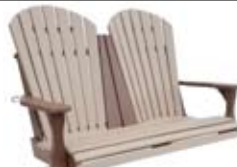
Comfy-Back Swing 4* * #CS4 - 9 53" W x 28" D x 30" H (64 lbs.)