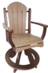
Daisy Comfy Swivel Counter Chair #DCSWC - 23 26" W x 30" D x 43" H Seat - 23 3/4" (59 lbs.)