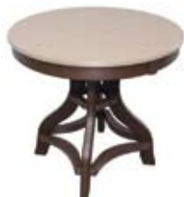
32" Round Dining Table #32-RTD • 29.5" H - (50 lbs.)