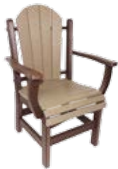
Daisy Comfy Arm Dining Chair #DCAD - 16 26" W x 20" D x 37" H Seat - 17 1/2" H (30 lbs.)